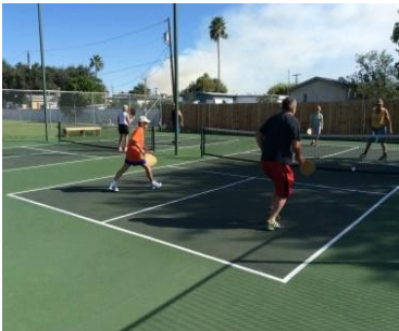
Great exercise, fun team sport

Note: Those without email can pick up their hard copy of the newsletter at the office.